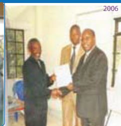
2006 Awarding change management training certificate to a retiree of a dairy products company.