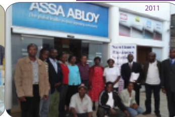
2011 A group photo after a change management and business skills training programme for the branded company