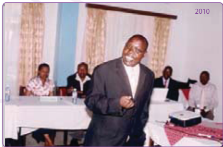
2010 The Newtimes Chief Trainer/Consultant in session during a PTAK trainer of trainers (TOT) course.

We are Truly Committed to Our Principle of Continually Taking Business to the Next Level.