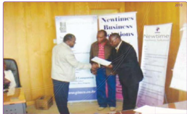
2010 A real estate company MD receives his participation certificate after a 3day business leadership and performance management training programme as his GM looks on.