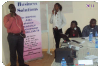
2011 Experiential learning process during a 3 day customer relationship management training programme