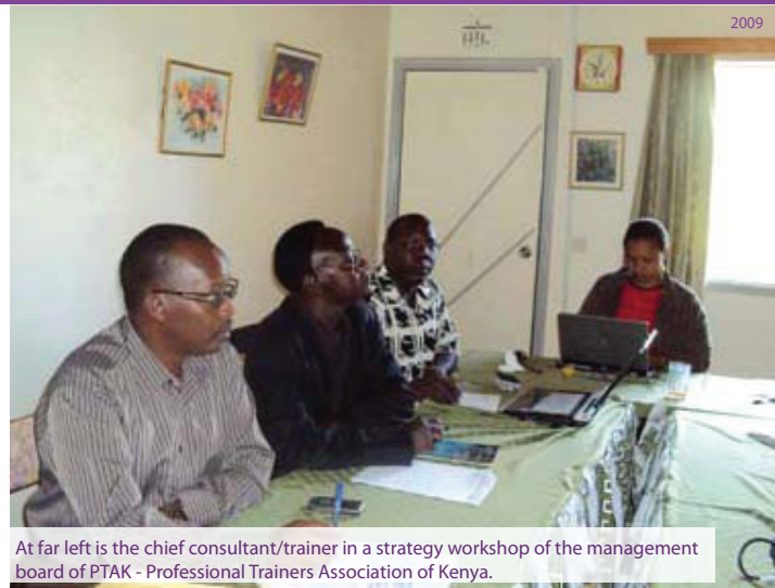
At far left is the chief consultant/trainer in a strategy workshop of the management board of PTAK - Professional Trainers Association of Kenya.