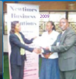
2009 A CEO of an insurance broking firm receives her participation certificate.