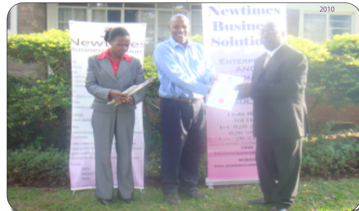
2010 The CEO of a flower farming and exporting company receives his participation certificate after a 3day business leadership and performance management training programme as his HR Manager looks on.