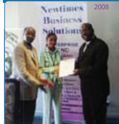
2008 An insurance company CEO witnesses as his manager receives her certificate.

We are Truly Committed to Our Principle of Continually Taking Business to the Next Level.