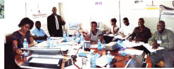
With staff of a Labs & Surgicals Company during their training programme held in the conference room of Newtimes Business Solutions